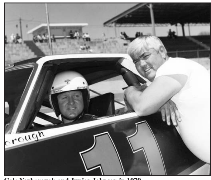
Cale Yarborough and Junior Johnson in 1979

onships - three straight by Cale Yarborough (1976-1978) and three by Darrell Waltrip (1981, 1982 and 1985).